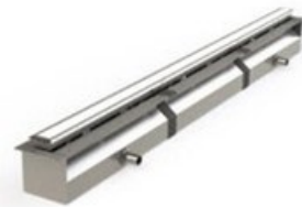
ARPOOL NEXUS (RECESSED)