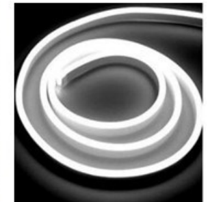
SUPER NEON-TOP (13X22MMH)