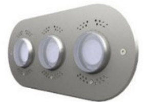
ARPOOL IRIS MEDIUM (ADJUSTABLE)