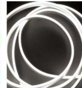
SUPER NEON (11X20MMH)