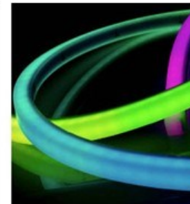
PIXEL | NEON-MAXI (24X12MMH)