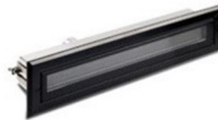
ARPOOL STYLE (RECESSED)