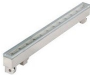
ARPOOL LINEAR (SURFACE)