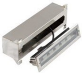
ARPOOL LINEAR (RECESSED)